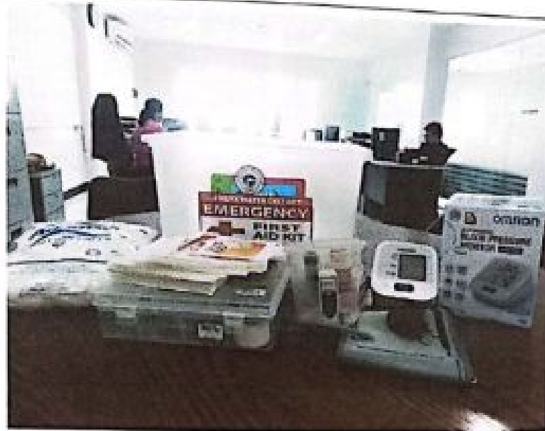
LEWAD HEALTH KIT