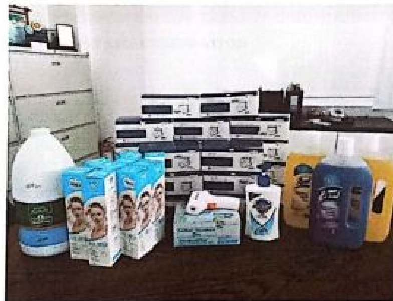
LEWAD PERSONAL PROTECTIVE EQUIPMENT (PPE)